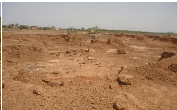
Photo 3b. Quarry on Ouagadougou green belt