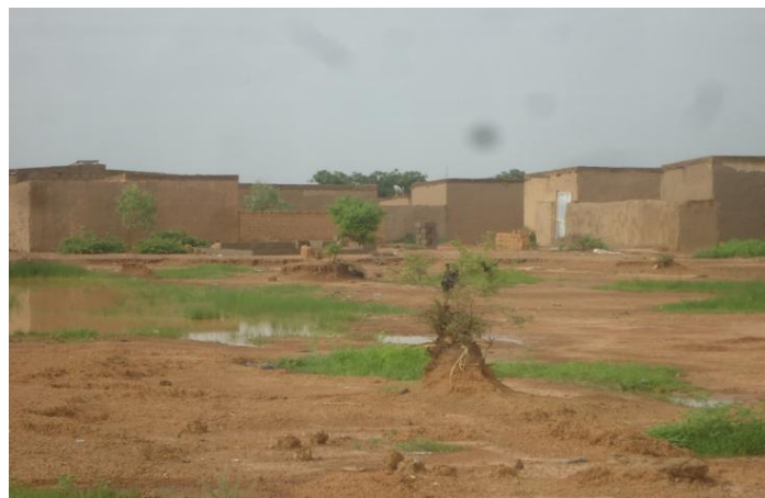
Photo 2. Spontaneous habitats on the green belt of Ouagadougou