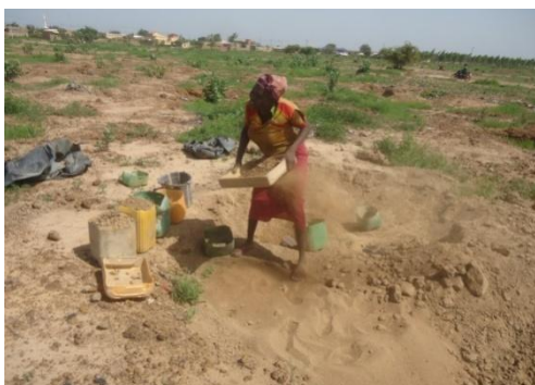
Photo 3a. Aggregate collection