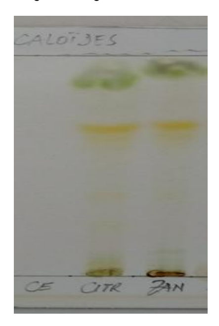
Fig. 1. Chromatoplate for alkaloids Stationary phase: Silicagel 60F<sub>254</sub>; Mobile phase: Toluene / Ethyl acetate / diethylamide (35: 10: 5); Developer: NaNO<sub>2</sub> 5%

The result of the leaves extracts by TLC chemical screening of C. asiatica , C. grandis , Z. gelletii are given in Figs. 1 to 4.