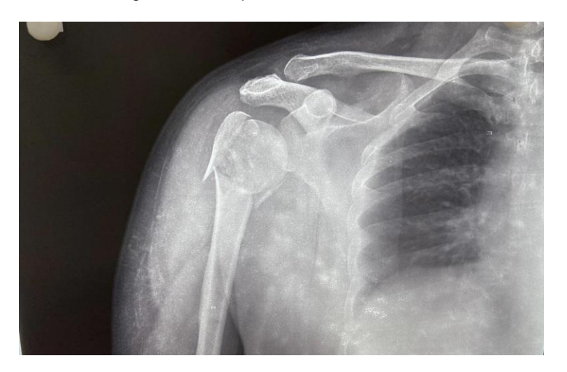
Fig. 2. X-ray image

Treatment of proximal humerus fracture is very important orelse may lead to movement abnormalities with nerve and artery injuries may be present. This study is done in such a way that all the patient treated well with the treatment of choice and patient was symptomatically improved. After this patient mobilized well and started doing regular activities. The appropriate type of treatment, either operative or nonoperative in the elderly, low-demand patient, also remains unsolved [9] Our study is in agreement with other studies, with more than 75% patients having excellent to satisfactory results [10].