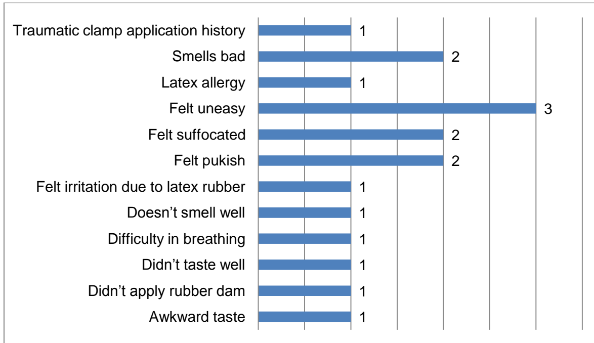
Table. VI. Reasons for rejection of rubber dam application by patients