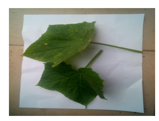
Fig. 5a. C. mannii showing no symptom of infection