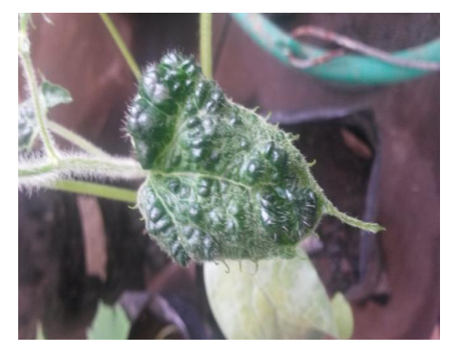
Fig. 5b. Severe rugosity and mottling on C. Mannii

reports Several have justified the use Trichoderma harzianum as control agent in controlling several plant pathogens. This study has revealed that leaves of C. mannii inoculated with a combination of Trichoderma harzianum (Control agent) and virus inocula (pathogen) showed no symptoms. Reports by [20] and [21] have revealed that "Trichoderma can acts indirectly as a plant-endophyte or as a mycoparasite, through the activation of systemic plant defensive responses. Through the colonization of the roots, Trichoderma is able to activate plant defenses against the attack of