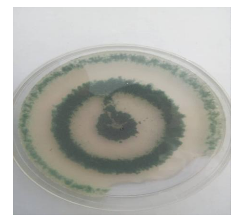
Fig. 1. Colonies of Trichoderma harzianum

Soil samples obtained in polyethylene bags from the University of Calabar piggery farm were picked up with a spatula and deposited into plates with PDA solution, which were then labeled. The inoculation plates were incubated at a room temperature of 27\pm1^{\circ} C, and fungal colonies were observed on a daily basis. Colonies were created and subcultured to generate pure isolate cultures (Fig. 1).