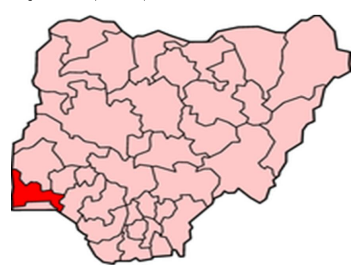
Fig. 1. Map of Nigeria showing Ogun State

Deseret Community Vision Institute (DCVI) is a branch of Eye Foundation Hospitals (a private institute) which was established in 2006 with the initial aim of reducing the blindness within the million population of Ogun East Senatorial District. Whilst the base in ljebu Mushin acts as the main base with outpatient and surgery