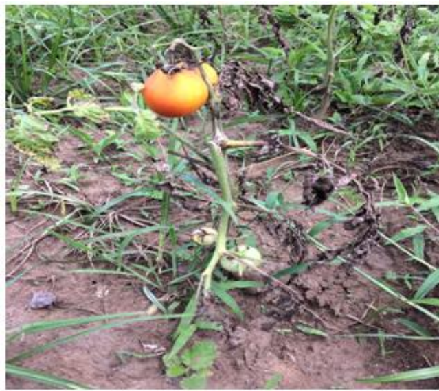
Fig. 2. Tomato grown in Mudachi irrigation Scheme (MIS) showing signs of wilting

3.44±0.75 dScm -1 . The TDS in the sampled water ranged from 124.00±5.51 mgL -1 (MWT) to 2063.00±41.36 mgL -1 (MFD) with an average value of 1672.53±122.87 mgL -1 . Further the turbidity of the collected water samples ranged from 60.40±5.16 (NTU) (MWT) to 215.17±4.40 (NTU) (MISIC) with an average value of 152.29±1.20 (NTU). Compared with the standard limit set by WHO values for Temperature (4°C to 18°C), pH (6.5 – 8.4), EC (3.0 dScm -1 ), TDS (1000 mgL -1 ), salinity and turbidity, the results from the study were above these set limits.