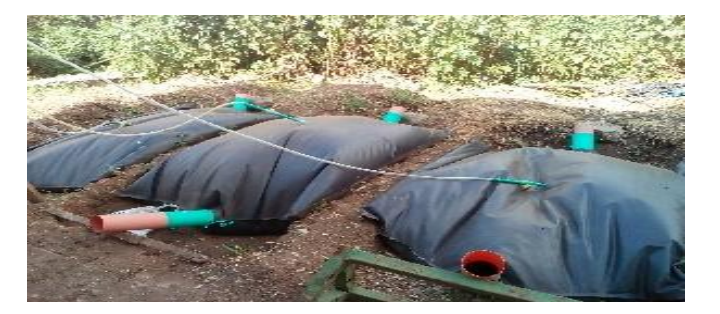
Fig. 1. Miniature biogas digesters set up at JKUAT

10 ml of the digested samples, blank and standard solutions were pipetted into 100 ml beakers and 10 ml of molybdivanadate solution added. To the resulting solution 25 ml of distilled water was added into each beaker, mixed and allowed to stand for at least 5 min. The percentage transmittance for each solution were measured at 430nm using a Shimadzu UV-Vis 1800.