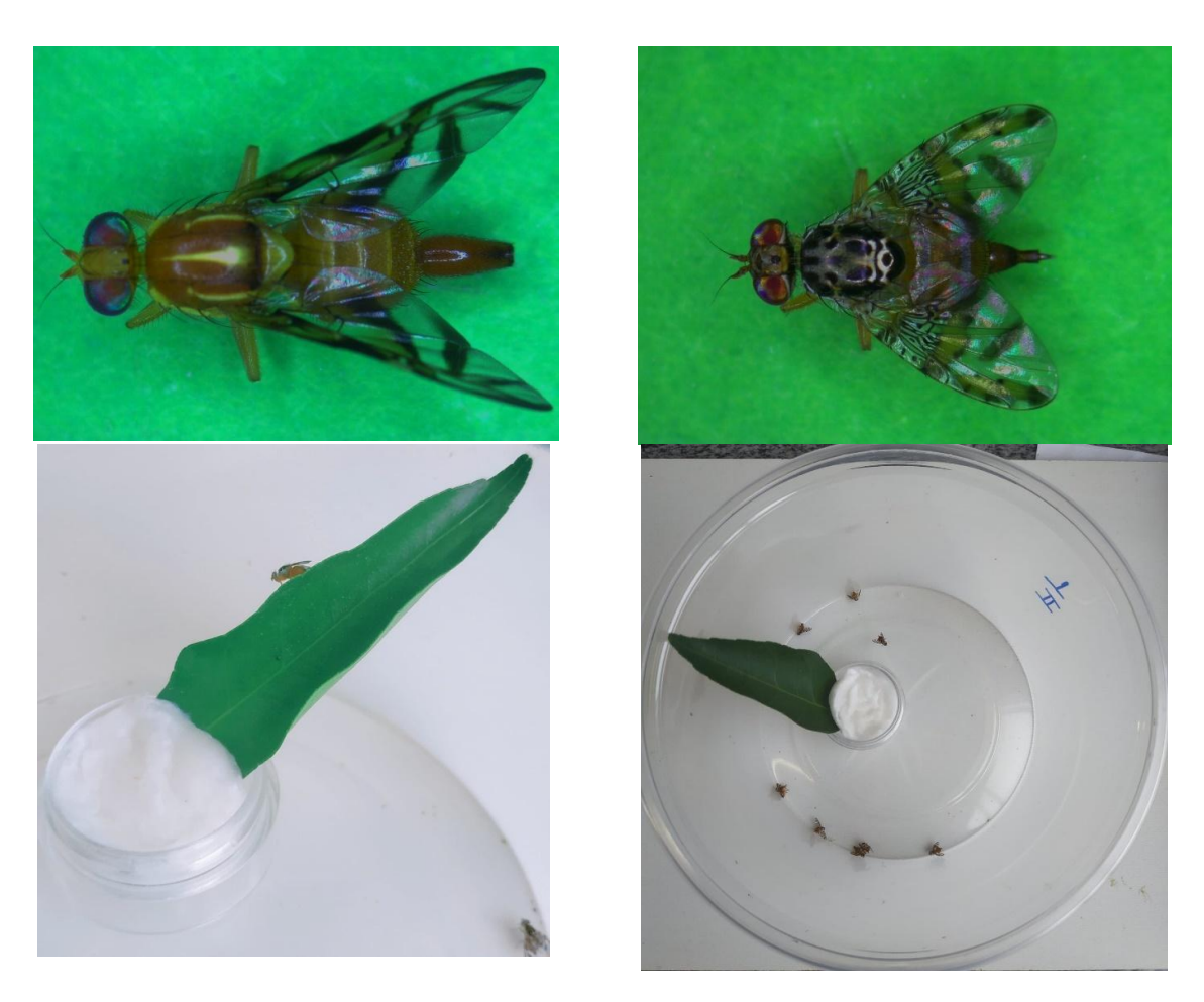
Fig. 1. Females of Anastrepha obliqua (Macquart, 1835) (A) and Ceratitis capitata (Wiedemann, 1824) (B) (Tephritidae); feeding of C. capitata (C); Dead adults inside the container (D)

Raga et al.; JABB, 24(11): 12-21, 2021; Article no.JABB.80292