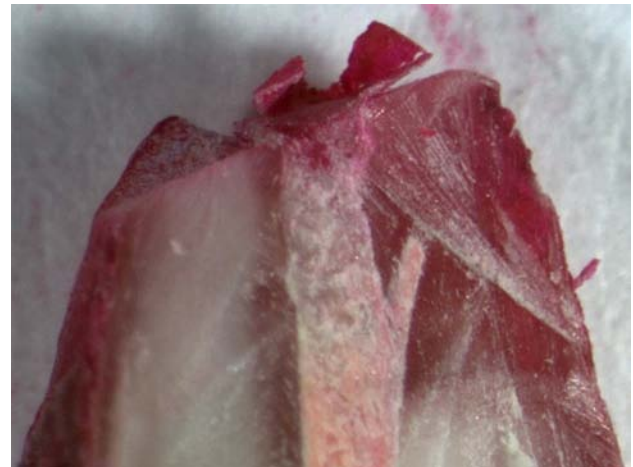
Figure 3. Minimal dye penetration into the Kryptonite bone cement when used as a retrograde filling material.