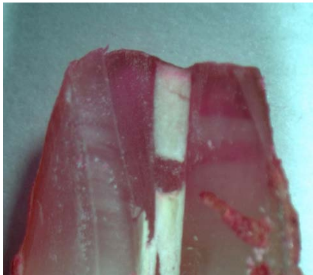
Figure 2. Minimal dye penetration was shown with MTA retrograde material.