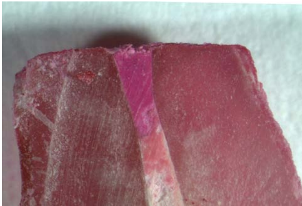
Figure 1. Dye penetration beyond the IRM retrograde material.

Amalgam has been traditionally used as a retrograde filling material, but it has some disadvantages, including scattering of amalgam particles into periradicular tissues, material corrosion and dimensional instability. 1 The present study determined the sealing