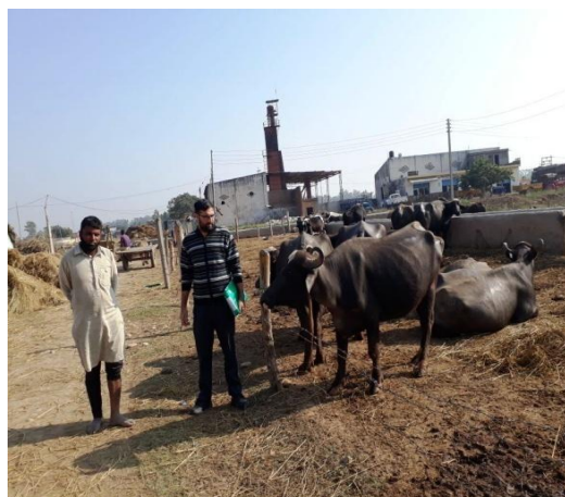
Unhygienic Milking areas