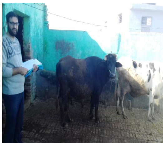
Unclean Floor and walls of animal house