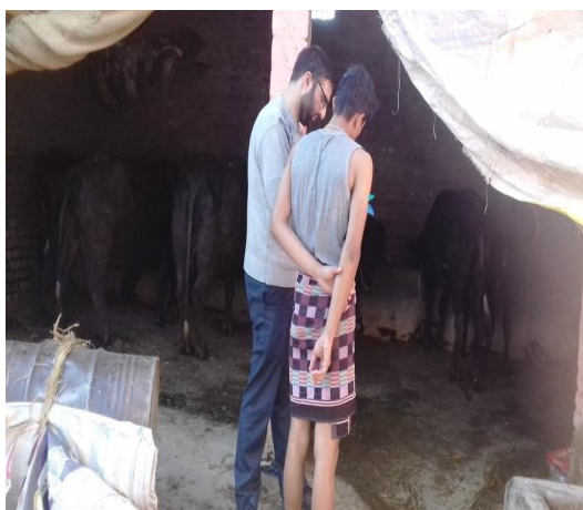
Animal house without Ventilation