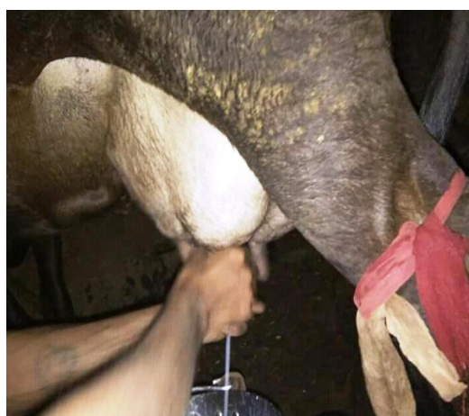
Unlearned Udder and hindquarter during milking