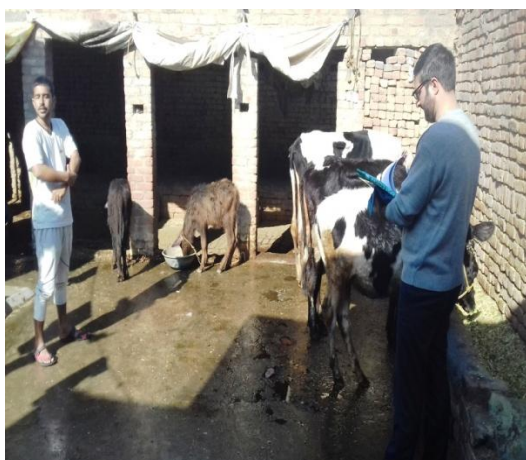
Traditional animal house without drainage system

An analysis of Table 1 shows that only 17.5 percent of respondents keep milking area clean, disinfested and free from flies and insects while majority of the respondents were reluctant to keep milking area clean and its disinfection, which may be because of lack of time and awareness about the importance of keeping milking area clean for quality milk production. None of the respondents' cleaned animal shed fifteen minutes before milking. The findings get support from the Mohankumar et al. [8].