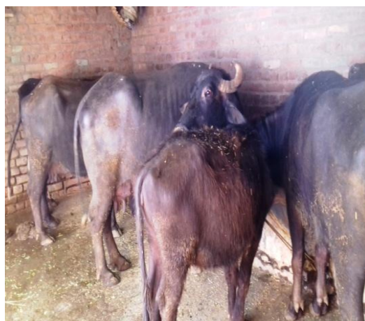
Dirty Hindquarter of Milch Buffalo which hampers CPM