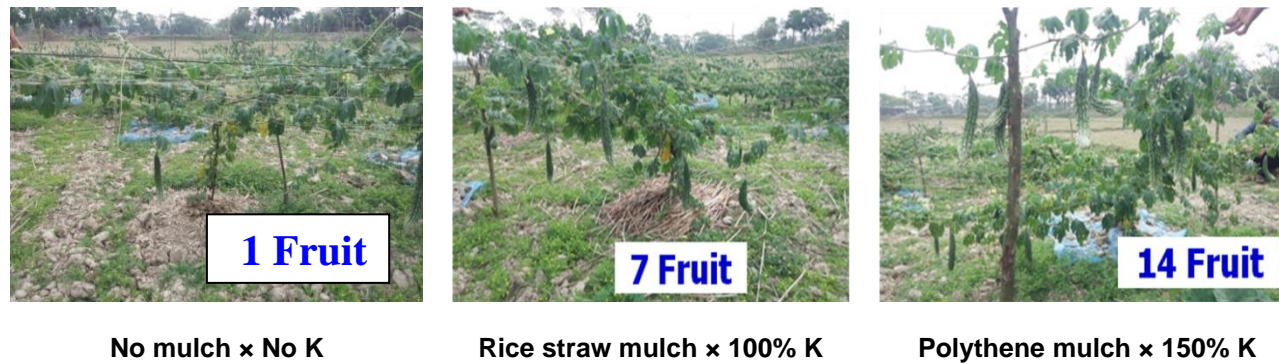
Fig. 1. Effect of mulching and K fertilization on number of fruits per plant at the time of first harvesting