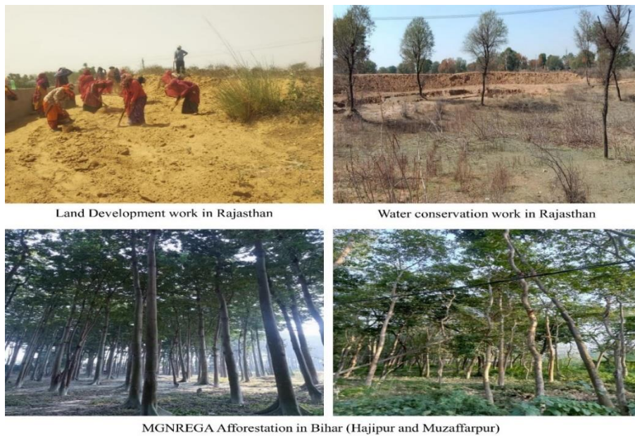
Plate 1. Impact of MGNREGA assisted afforestation on climate change mitigation

such as these are intimately tied to the traditional cultural structures and agro-based economic activities of rural civilizations. The various MGNREGA programmes are closely connected in their efforts to safeguard natural resources and develop their potential sustainability. The most significant programmes are conservation and harvesting of water, plantations, drought-proofing, land development, micro irrigation, flood control, and flood protection (Plate 1, Fig. 1).