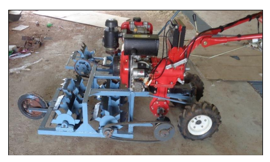
Fig. 1. Developed self-propelled rotor power weeder

The most significant component within the total costs of a machine is depreciation. It quantifies the reduction in the value of a machine over time, irrespective of its usage [10,11]. The cost estimations for both the prime mower and rotor power weeder were calculated utilizing the above-mentioned formulas.