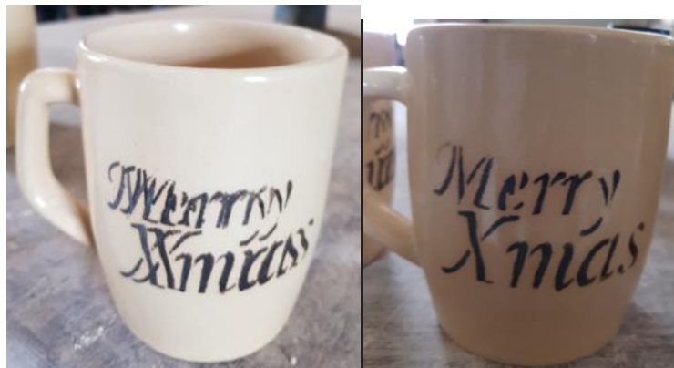
Fig. 4. Enamels from bone ash (left) and tin oxide (right) print on ceramic cups