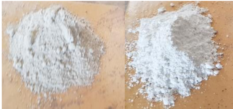
Fig. 2. Bone ash (left) after crushing and commercial tin oxide (right)