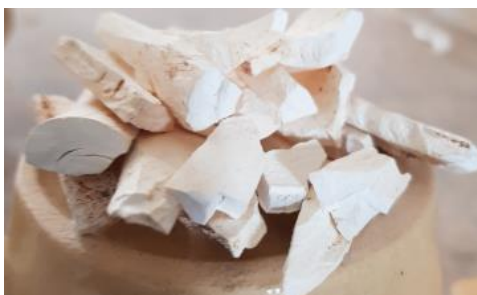
Fig. 1. Cow bone after calcination

Physical examination of enamel produced from bone ash had a low bloating when compared with that of tin oxide. Also, the samples decorated with bone ash enamel had a low tendency of crawling [18]. In terms of opacity, the ceramic cups decorated with bone ash and zinc oxide enamels came out brilliantly (Fig. 4). This indicated that cow bone ash is a good enamel opacifier as tin oxide. The durability test of the opacifier produced and that from tin oxide was excellent as the ceramic cups were resistant to acidic and basic attack [15].