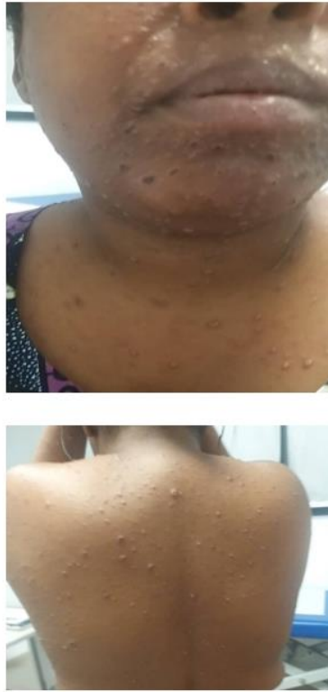
Figs. 1 and 2. Lesions of different ages (vesicles, pustules, umbilicated papules and crusts)