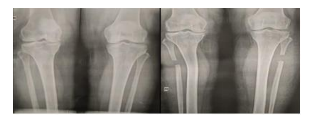
Fig. 1. Preoperative and one-year postoperative standing X-ray of both knees (AP and lateral views) shows medial compartment knee osteoarthritis type 2 and also shows good improvement in the radiological assessment of the medial joint space of both knees