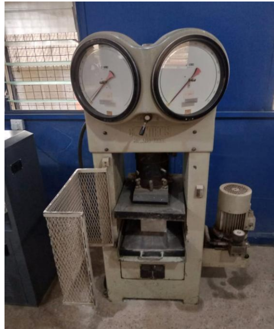
Fig. 2. Testing of concrete specimen in the test machine