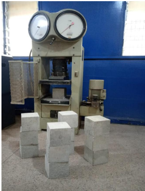
Fig. 1. Concrete test specimens