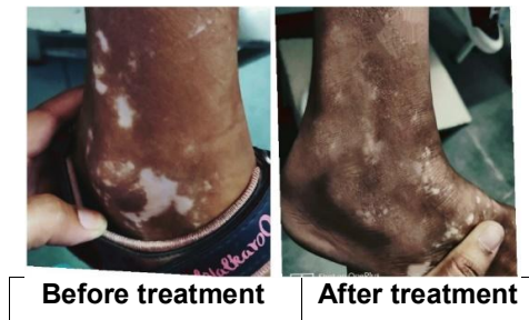
Fig. 2. Photos of case study