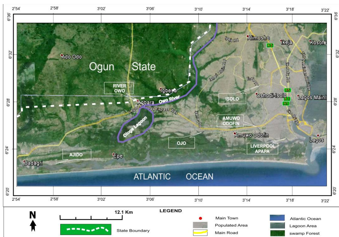
Fig. 1. Sampling locations