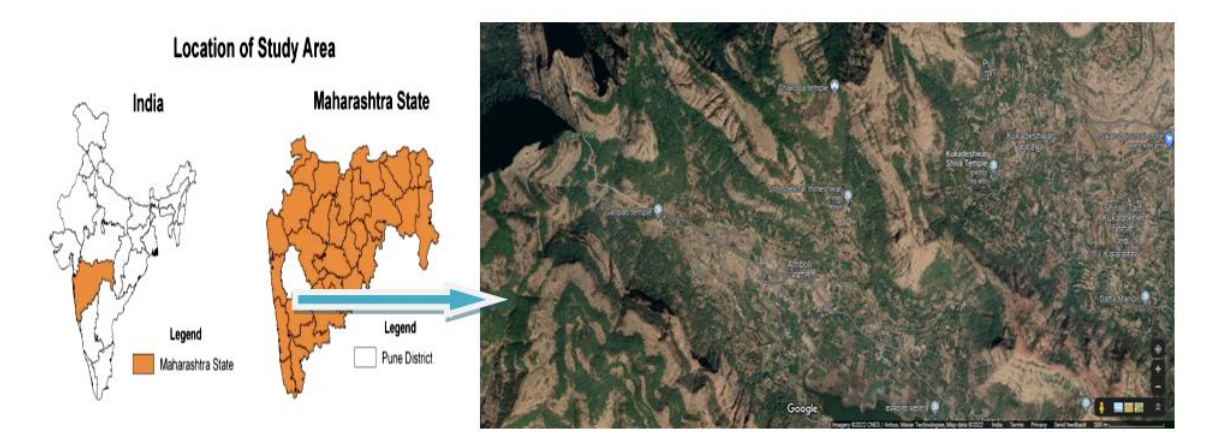
Map 1. Study areafrom junnar tehasil (Table 3)