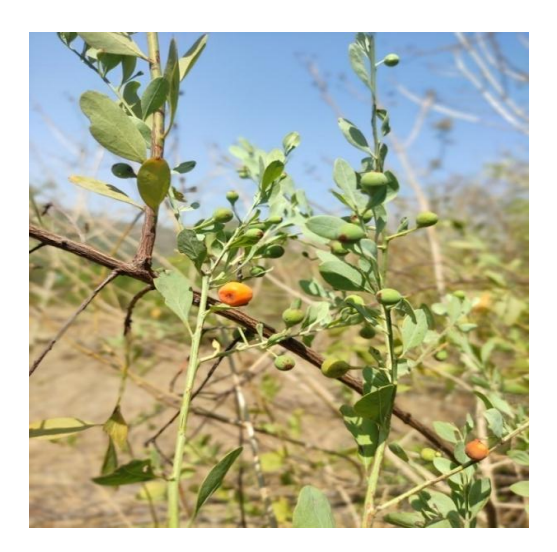
Fig. 1.Osyris quadripartita from Northern Western Ghats of Maharashtra

Pith: Pith areunlignified, large pitted parenchymatous cell with thin walled. pith region of stem observed solitary crystals.