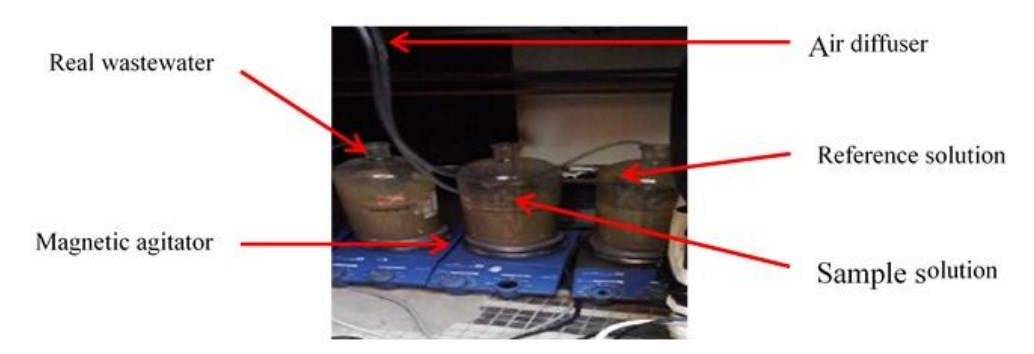
Fig. 1. Biological treatment device using the ZW method