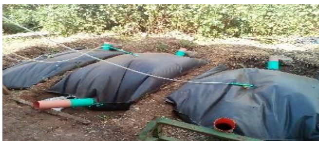
Fig. 1. Miniature biogas digesters set up at JKUAT

10 ml of the digested samples, blank and standard solutions were pipetted into 100 ml beakers and 10 ml of molybdivanadate solution added. To the resulting solution 25 ml of distilled water was added into each beaker, mixed and allowed to stand for at least 5 min. The percentage transmittance for each solution were measured at 430nm using a Shimadzu UV-Vis 1800.