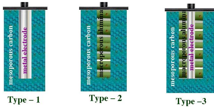
Fig. 3. Modeled electrodes