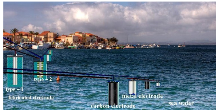
Fig. 5. Proposed setup of GCEQ for SGP station