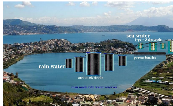
Fig. 4. Proposed setup of CCEQ for SGP station