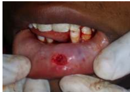
Fig. 4. Excision of mucocele