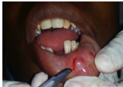
Fig. 3. Incision of mucocele

Local infiltration was given in the lower lip with 2% lignocaine. Elliptical incision was given near the borders of the mucocele (Fig. 3). Complete excision of the mucocele was done (Fig. 4). The surgical site was irrigated with Povidine iodine saline solution and primarily closed with 3-0 silk sutures. All postoperative instructions were given and analgesics were prescribed. Follow up of 1 month was uneventful (Fig. 5). Follow up of 8 months has not shown any recurrence (Fig. 6). The excised tissue was sent for histopathological investigation.