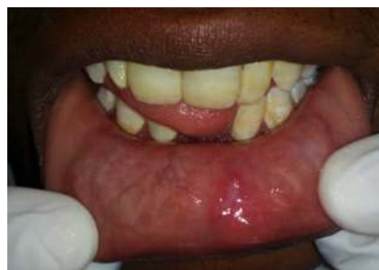
Fig. 5. Healed tissue (1 month follow up)