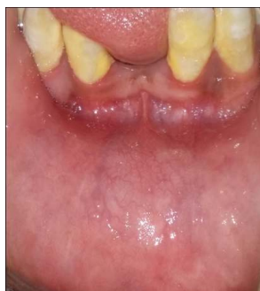
Fig. 6. No recurrence (8 months follow up)