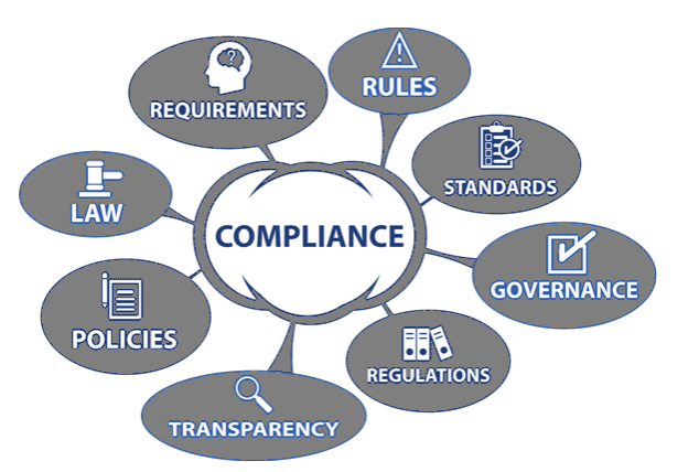
Fig. 1. Necessity of compliance

The regulatory framework in the United States is characterized by a complex system of laws, acts, and regulations designed to protect public health, ensure product safety, and maintain industry standards. The United States Food and Drug Administration (USFDA) is the primary regulatory authority responsible for overseeing compliance in various sectors, including pharmaceuticals, medical devices, and food and beverages, as depicted in Table 1, 2 and 3. Understanding the regulatory framework is crucial for companies operating within these industries [3].