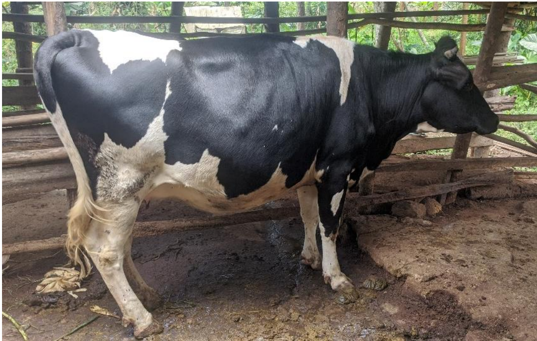
Fig. 1. Holstein cows photo