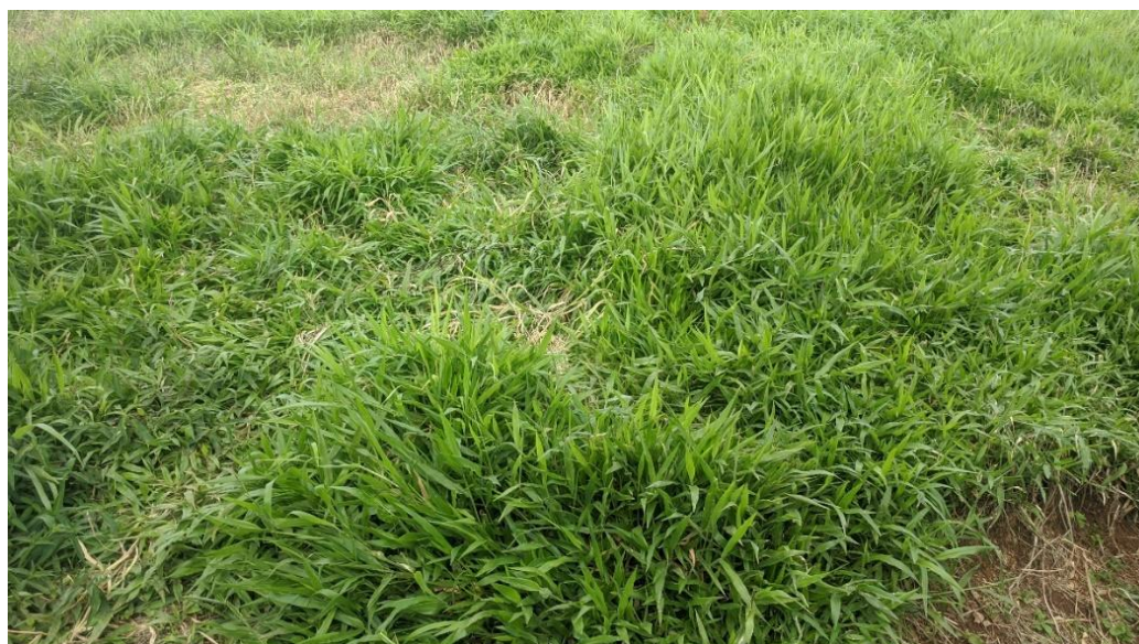
Fig. 3. Brachiaria field of a production unit in the study area