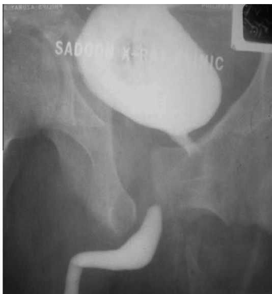
Figure 2 A preoperative combined antegrade and retrograde cysto-urethrogram shows an open rectangular BN with almost parallel right and left borders. The patient was incontinent after a successful perineal urethroplasty.

controversial subject. Several investigators hold that BN incompetence might be treated concomitantly with the urethral repair [10]. Others prefer to manage the urethral injury and BN incompetence sequentially [1].