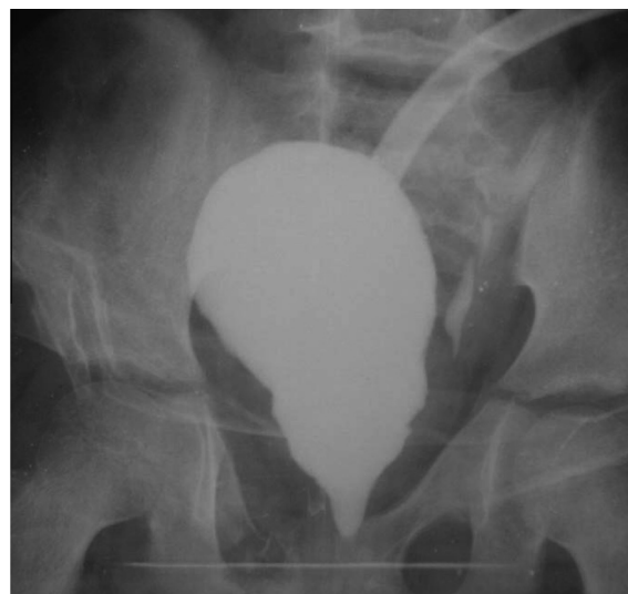
Figure 1 A preoperative cystogram at rest shows funnelling of the triangular BN. The patient was completely continent after perineal urethroplasty.

The diagnosis of BN incompetence in patients undergoing repair of a PFUI is not always easy, largely because these patients are usually dependent on a suprapubic catheter and no urine can be passed or leaked via the urethra. Thus, the documentation of urinary incontinence is not possible subjectively or objectively. In fact, the diagnosis in these patients has been entirely dependent on the finding of an open BN on the resting cystogram and/or a fixedly open BN on suprapubic cystoscopy. However, this is not always true. While an open BN in these patients might be the result of an intrinsic anatomical damage leading to its dysfunction, it might also be the result of normal funnelling of the BN stimulated by a detrusor contraction. This contraction can be voluntary, as during an attempt at voiding, or an involuntary uninhibited contraction because of the