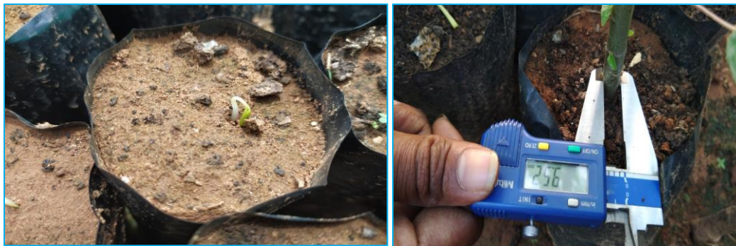
Initiation of germination of papaya seed Measuring the diameter of the stem