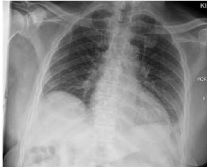
Fig. 3. Chest X Ray

Chest X Ray showed Possible mild left-sided pleural effusion and left basilar lung infiltrate or pneumonia. Echocardiogram showed Normal left ventricular systolic function with Ejection fraction of 60-65% with Mild aortic and tricuspid regurgitation. Duplex imaging, color doppler and spectral analysis was performed on bilateral carotid system demonstrating no evidence of hemodynamically significant disease.