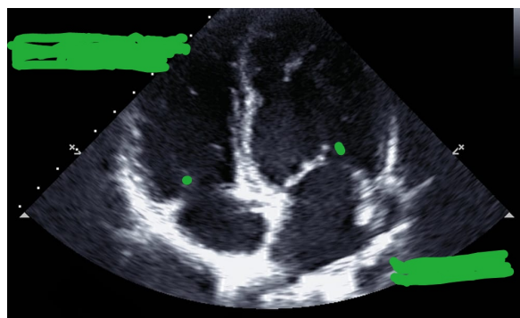
Figure 2. Cardiac ultrasound section showing aortic stenosis.