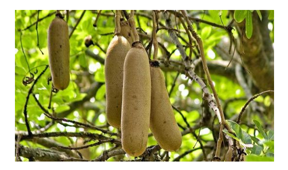
Fig. 1. Kigelia africana fruit (Pandoro in Yoruba and Ohi in Ibo Language)

different sellers in the Mushin market in Lagos suburb, Nigeria, in November 2014. The fruits and stalks were identified and authenticated by the Department of Botany, Faculty of Science, University of Lagos, Nigeria. The specimens were given voucher no LUH 6487 ( K. africana ) and no LUH 6488 ( S. bicolor ) respectively and were deposited in the Department's Herbarium. The plant materials were washed with a copious amount of clean tap water and spread to drain, then cut into small pieces and dried in an oven at a temperature of 45<sup>o</sup>C for seven days.