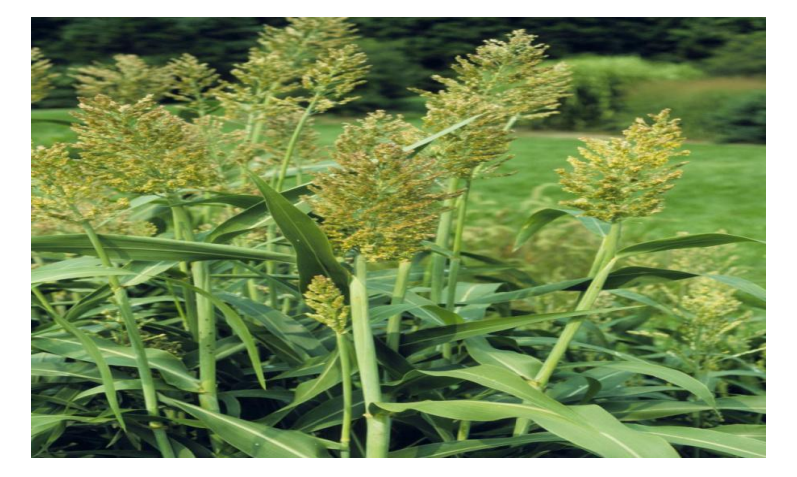
Fig. 2. Sorghum bicolor leaves stalks (local name: Poroporo in the Yoruba Language)

Table 2 shows the GC-MS analysis of hydroethanolic fruit extract of K. Africana with the identification of phytochemical constituents confirmed based on peak area %, retention time, molecular formula and molecular weight, with 9, 12-Octadeadienoic acid (Z, Z) found as the major compound.