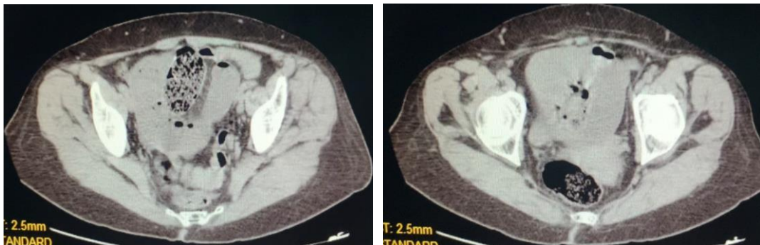
Fig. 1. CT scan showing a loop incarcerated in an internal hernia

To note, exploration does not find necrosis or peritonitis. The post-operative follow-up is simple and the patient was discharged on the 3rd day after the operation.