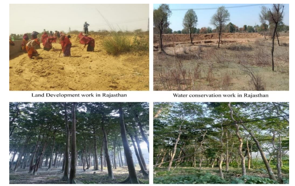
MGNREGA Afforestation in Bihar (Hajipur and Muzaffarpur)

such as these are intimately tied to the traditional cultural structures and agro-based economic activities of rural civilizations. The various MGNREGA programmes are closely connected in their efforts to safeguard natural potential resources and develop their sustainability. The most significant programmes are conservation and harvesting of water, plantations, drought-proofing, land development, micro irrigation, flood control, and flood protection (Plate 1, Fig. 1).